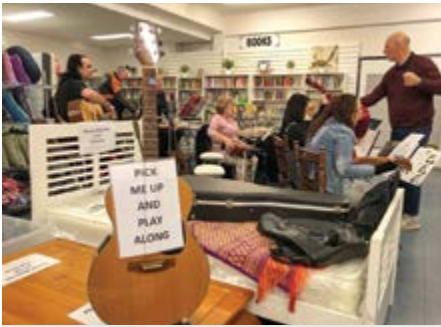
Everyone is welcome at the Just Guitars community.

From beginners to more accomplished players, everyone is welcome at Just Guitars, which started three years ago at Salvos Stores in Fremantle (WA), and is now also at Subiaco Salvation Army.