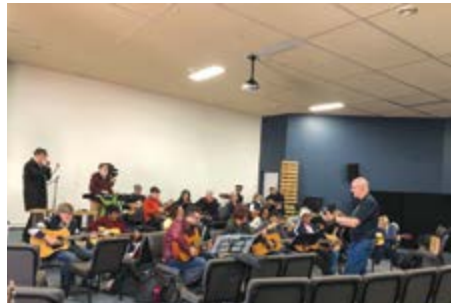
Just Guitars is a place for people to learn new skills, make friends and feel welcome and at home.