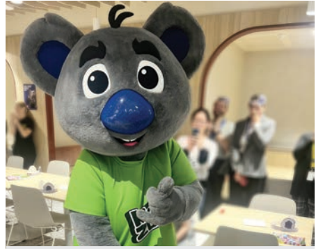
Cousin Koala at the anniversary celebration.

Using pop culture in a relevant, positive and educational way, each week the magazine features competitions, video game news, Bible stories, cartoons, puzzles and activities. It is enjoyed by 27,000 readers each week.