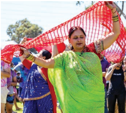
Colour, culture and celebration at the Holi festival.

The community event is known worldwide as the ‘festival of colours’, with attendees