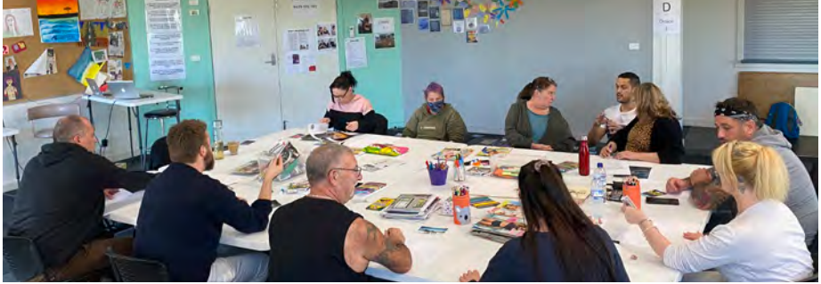
Group discussions are a regular part of the START Community program.