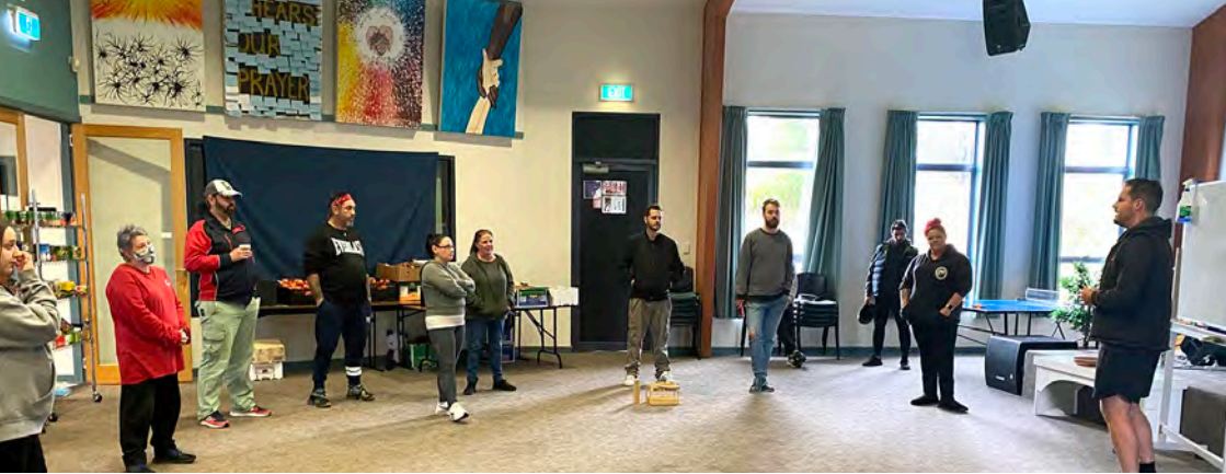
Local sporting groups lead indoor and outdoor recreational activities for program participants.